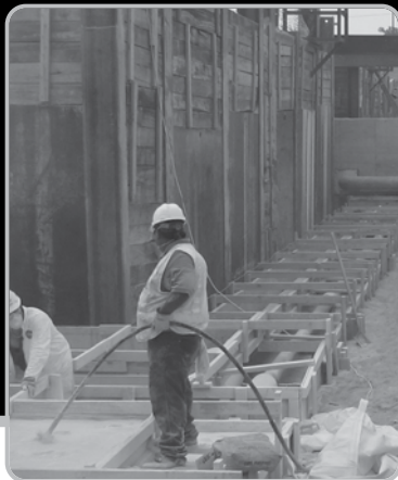
THERMAL ENERGY CORP (TECO) CHP EXPANSION PROJECT GILSULATE ® 500XR HAS BEEN THE SYSTEM INSULATING/PROTECTING TECO'S STEAM/COND./PUMP COND. FOR 25 YEARS! "FAILURE IS NOT AN OPTION FOR TECO."

The global economy and environmental demands have dramatically impacted the energy generation and distribution marketplace trifold. Owners are experiencing the skyrocketing maintenance and operating costs coupled with dwindling budgets; Gilsulate ® 500XR is the proven solution. Gilsulate ® 500XR offers a multitude of benefits with key points such as: long-term reliability, no maintenance system, superior BTU reductions, cost-effectiveness, flexibility, simplistic design & installation making it the overall value and choice owners are seeking today!