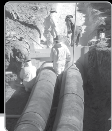
NATIONAL CENTER THERAPEUTICS MANUFACTURING - TEXAS A&M 24" HDPE CWSR INSULATED WITH GILSULATE ® 500XR. A&M'S CAMPUS DISTRIBUTION MASTER PLAN FOR CWSR/HWSR RECENTLY CHANGED FROM PIP TO GILSULATE ® 500XR.

Gilsulate International Incorporated • 800-833-3881 • 661-799-3881 • www.gilsulate.com